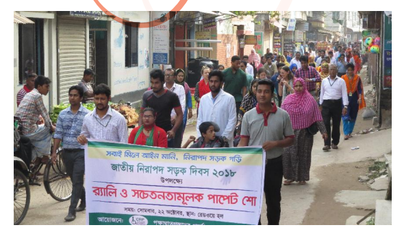
Rally, human chain and awareness raising puppet show on road safety issues on National Road Safety Day observation at CRP