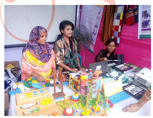
CRP's mental health project staff displaying different items in CRP's stall