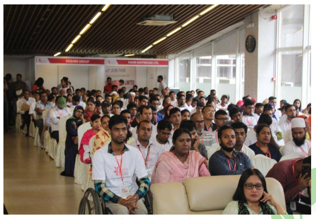
Attendees in the job fair