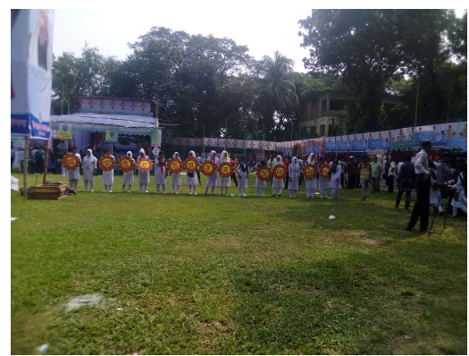
lanauguration of the fair at Savar Upazila ground

The Government of Bangladesh organized the 4th countrywide, National Development Fair from 4- 6 October 2018. CRP participated in this fair organized by Savar Upazila for promoting CRP's services to visitors. In the fair CRP's stall was adorned with handicrafts made by women with disabilities, wooden toys and puzzles, various publications and mental health project activities. The special needs children from William and Marie Taylor School (WMTS) also took part in an inclusive cultural programme and amazed the crowds with their mesmerizing performance at Savar Upazilla playground. The visitors really appreciated and enjoyed watching CRP's activities.