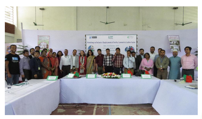
Attendees in the workshop