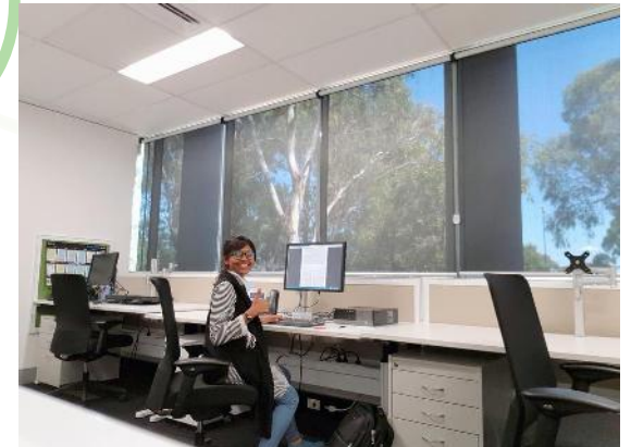
Me in my research office room

Apart from academic life, I am learning to view life in different seasons and keeping trust in the process. I am learning patience, as I am meeting new people every day and everyone has something different to offer. I am trying to get more open in the process of accepting "new" to live, which will hopefully improve my critical thought process. Accepting the different culture, tasting the foods and the afternoon walk with thyself will eventually make a better version of me, I believe.