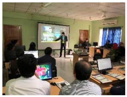
Workshop with post-graduate international students