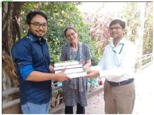
Books from Japan handed over to the head of occupational therapy department, BHPI