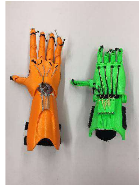
Artificial hands for children made by 3D printer