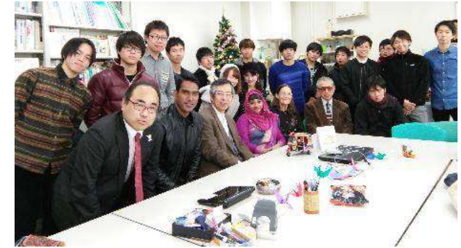
Presentation on CBR