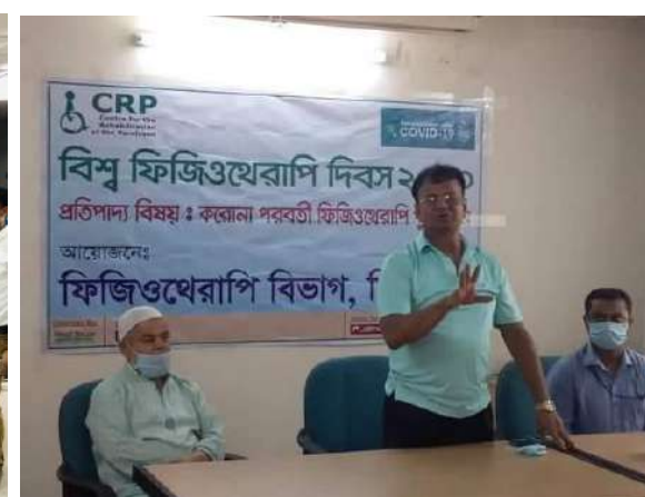
World PT Day celebration at CRP-Pabna