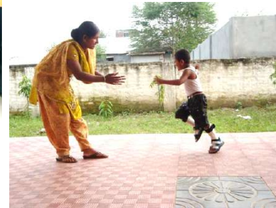
A child with his orthosis