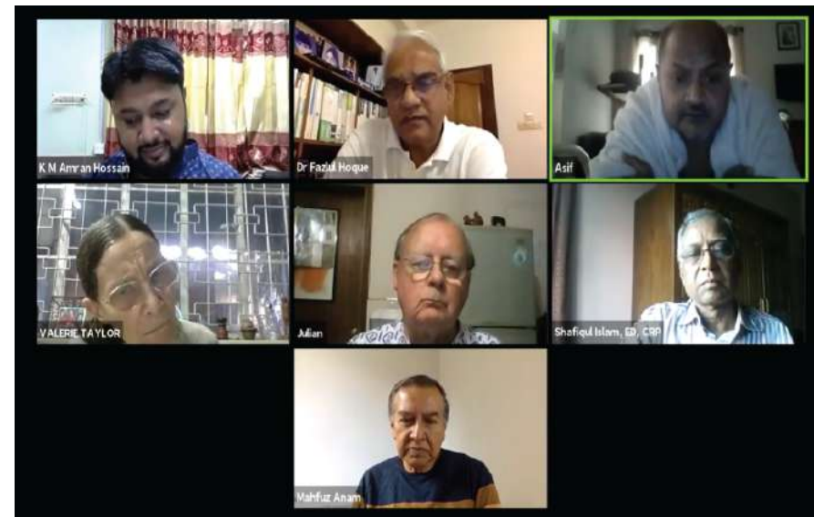
Guests speaking in the Webinar