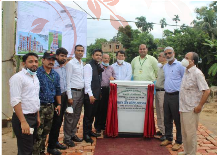
Guests inaugurating the construction of the permanent centre of CRP-Moulvibazar, Afsarul & Akhtarul Haque Centre