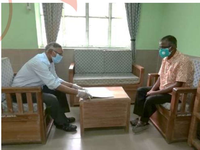
CRP's Executive Director signing the agreement