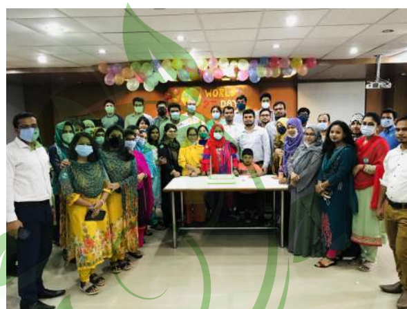
World PT Day celebration at CRP-Mirpur