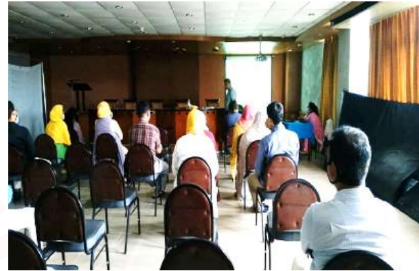
Presentation on P&O services at CRP-Mirpur

The aim of this presentation was to provide an orientation about the P&O services to the doctors, physiotherapists, occupational therapists, speech and language therapists and prosthetist and orthotist professionals. In the past, the department had a lack of machineries and could provide only orthosis of lower limb but now we can provide all types of prosthesis and evidence based orthosis for both upper and lower limb through MDT approach. All lacking and limitations were discussed openly in the program and the professionals requested for their kind cooperation in spreading the information about the new services offered at the P&O Department of CRP.