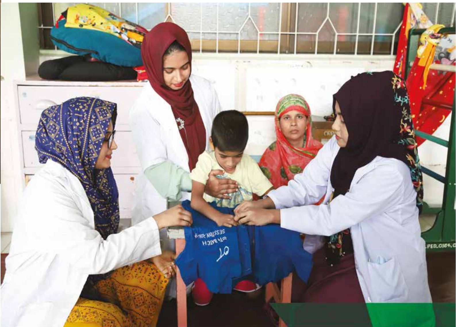
A team of therapists including PT, OT and SLT working in the paediatric department

An online MAITS training of trainers on working with children with NDD and Posture care management for children with CP and multiple disabilities was arranged by Motivation India and held in March 2022. Two Physiotherapists attended Assessing Clubfoot Treatment (ACT) basic Club Foot treatment training in December 2021.