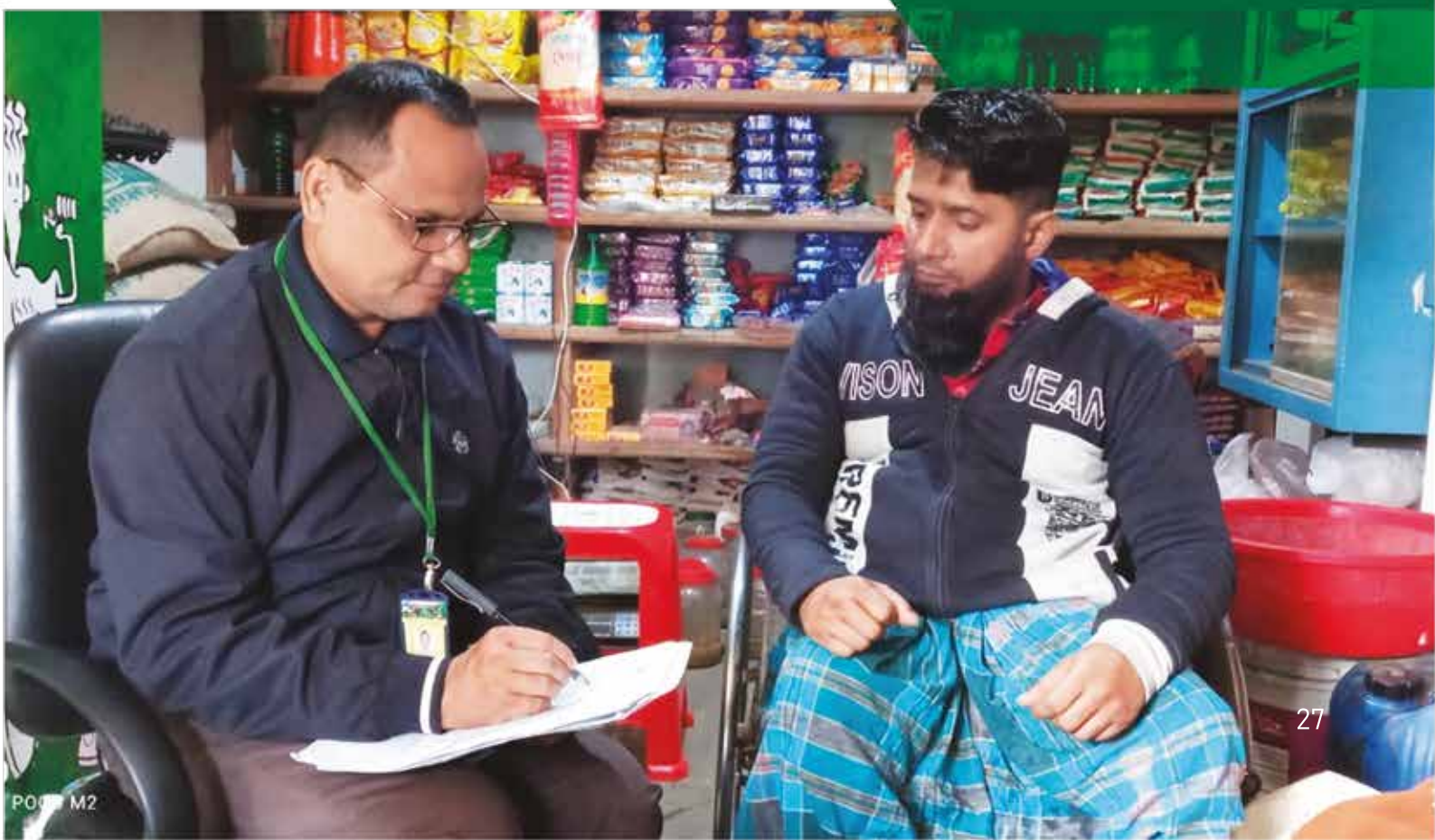
A CBR staff member visiting a patient with SCI to assess his present condition