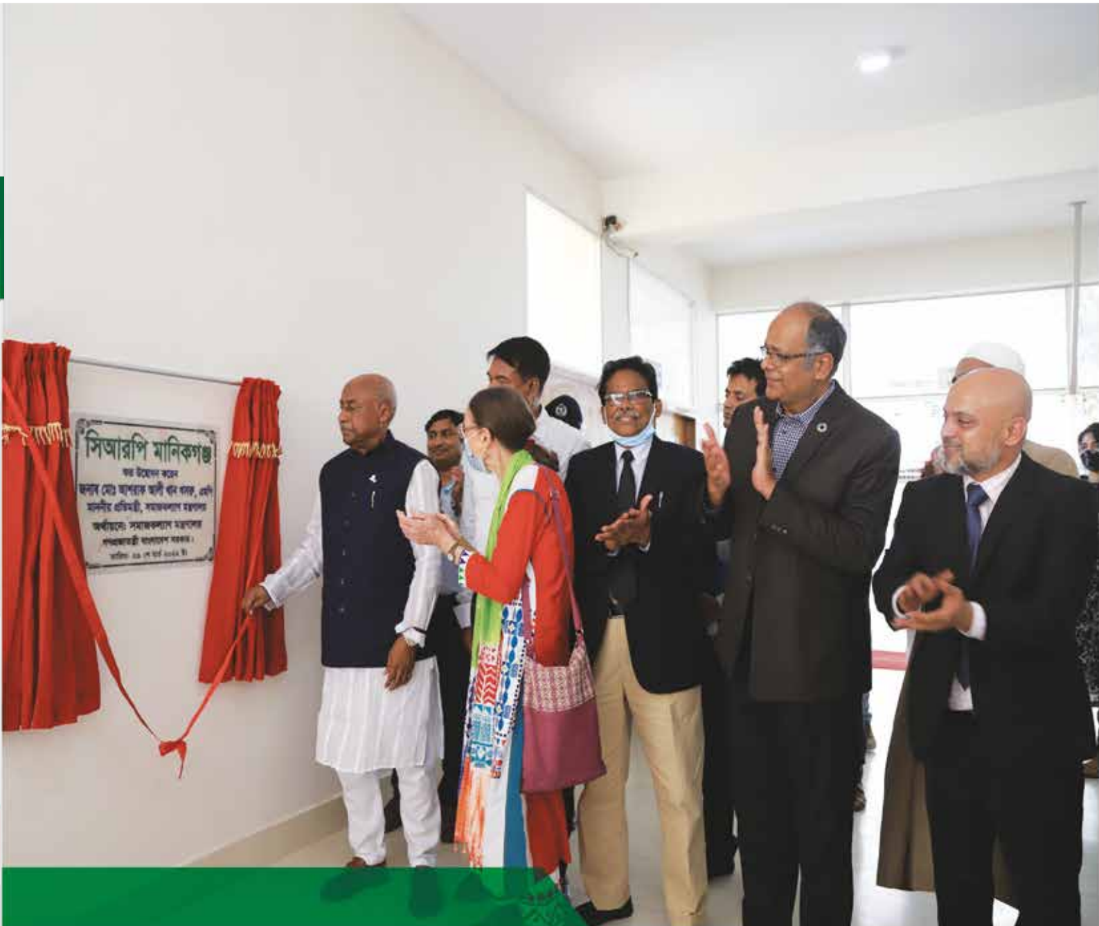
Honourable State Minister of Social Welfare Ministry inaugurating CRP Manikganj Centre

Amount of subsidy provided to 18 poor patients: 20,230