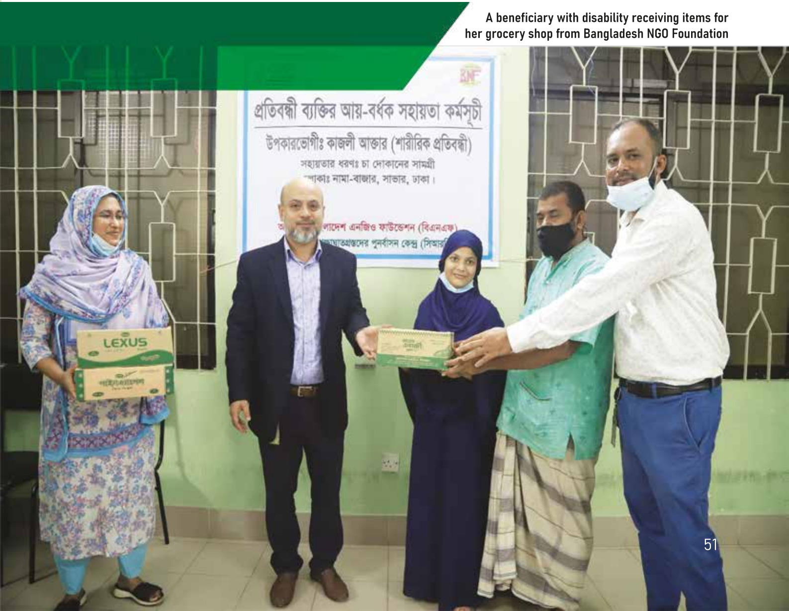
A beneficiary with disability receiving items for her grocery shop from Bangladesh NGO Foundation