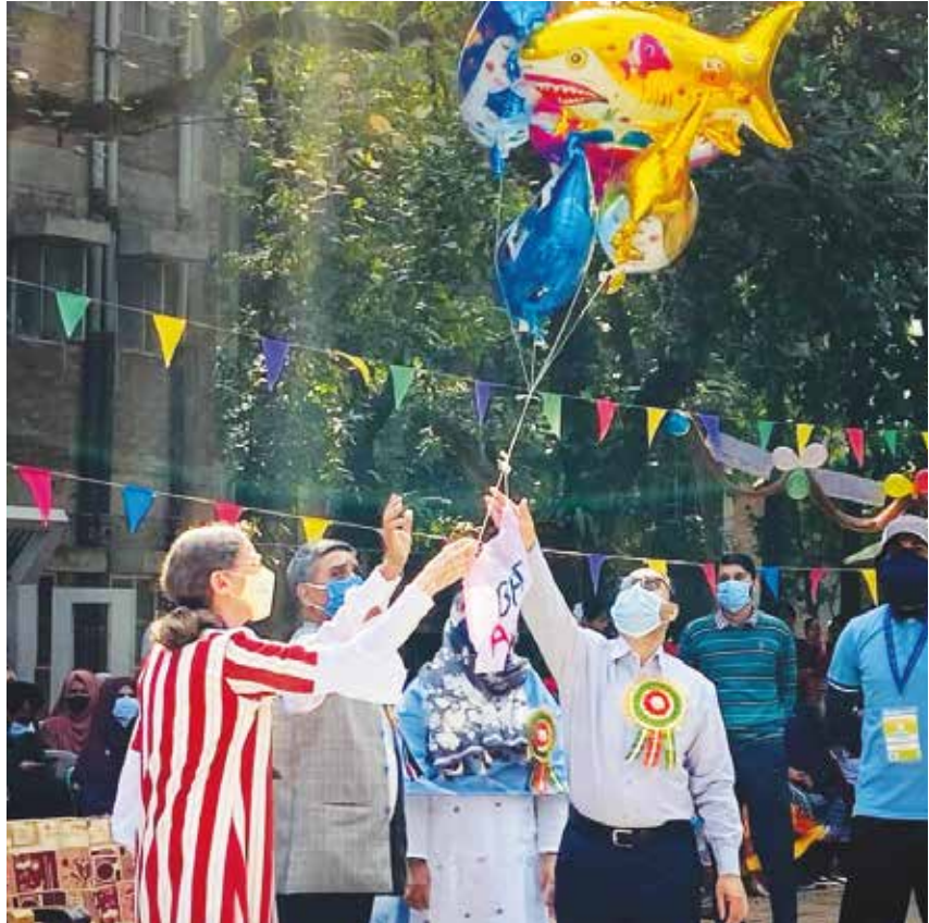
Guests inaugurating the Annual Sports of BHPI

The main objective of BHPI is to produce skilled health professionals. A total of 742 students studied at BHPI during the reporting year. A total of 15 seats have been increased respectively in the BSc and MSc Physiotherapy programs. The Rehabilitation Science Department completed the 1st phase of the Master in Rehabilitation Science project and started the 2nd Phase. A total of 12,033 books, 1,774 theses, 3,010 printed journals and more than 15,000 E-Journals and books are available in the BHPI library. A total of 71 students received stipends and scholarships, among them BHPI waived full and half of the tuition fees for 30 and 22 students respectively in this year.