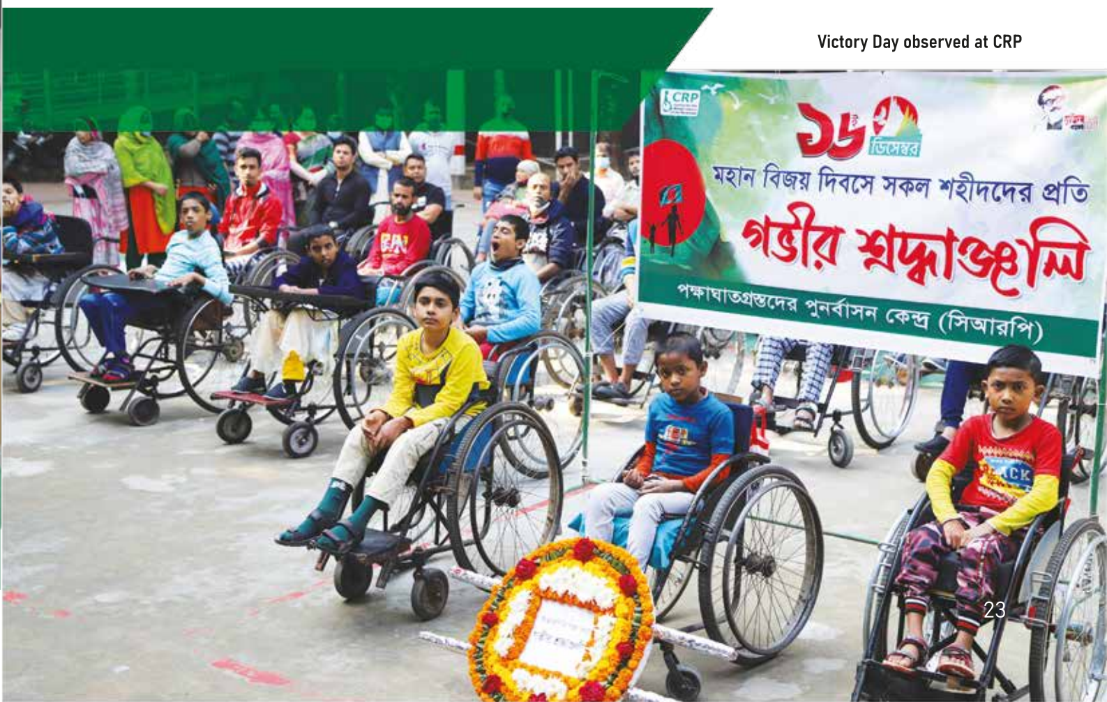
Victory Day observed at CRP