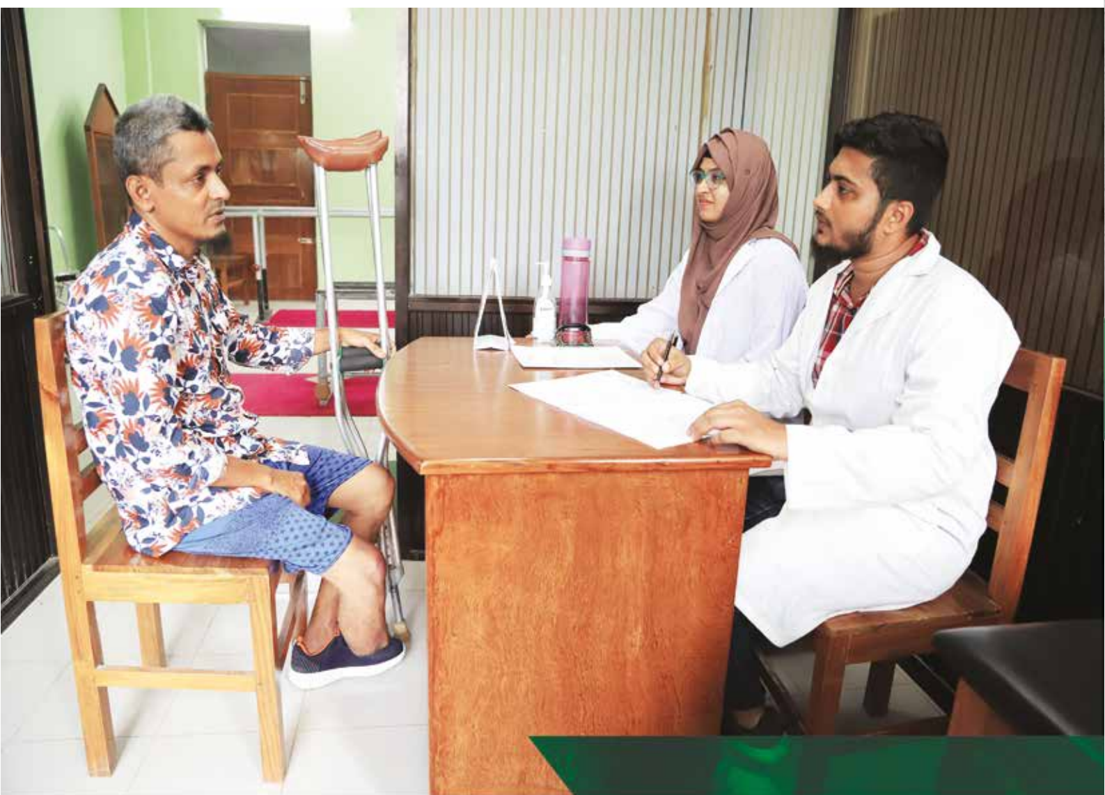
Professionals doing the primary assessment of an amputee patient

The department arranged eight mobile camps in Sylhet and Mymensingh where approximately 100 beneficiaries received services in each camp. The demand for prosthetics and orthotics devices with advanced technology is increasing among the service users. Therefore, devices with updated technology are manufactured on a regular basis. We have gender-specific qualified professionals for producing spinal orthoses. The contribution of ICRC is noteworthy in terms of raw material support, professional skill development and higher education. Four staff from this department have already completed their bachelor level professional study in India and Thailand in addition, four certified ISPO category-3 technicians are providing services at Savar, Barisal, Rajshahi and Chattagram. All are trained from Cambodian School of Prosthetics and Orthotics (CSPO). Moreover, one of ISPO Certified Prosthetist and Orthotist professional is doing his master's program in the UK. P&O Department has planned for strengthening the outreach program by increasing the number of mobile clinics arranged across the country.