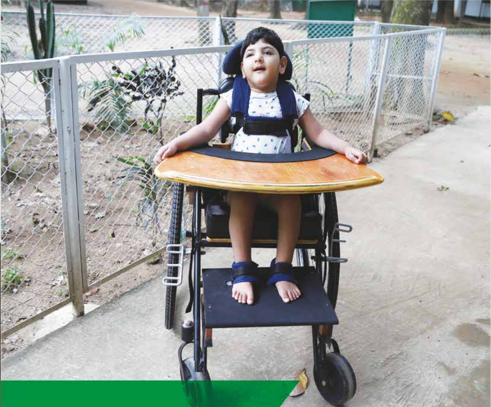
A child with Cerebral Palsy using a supportive seat