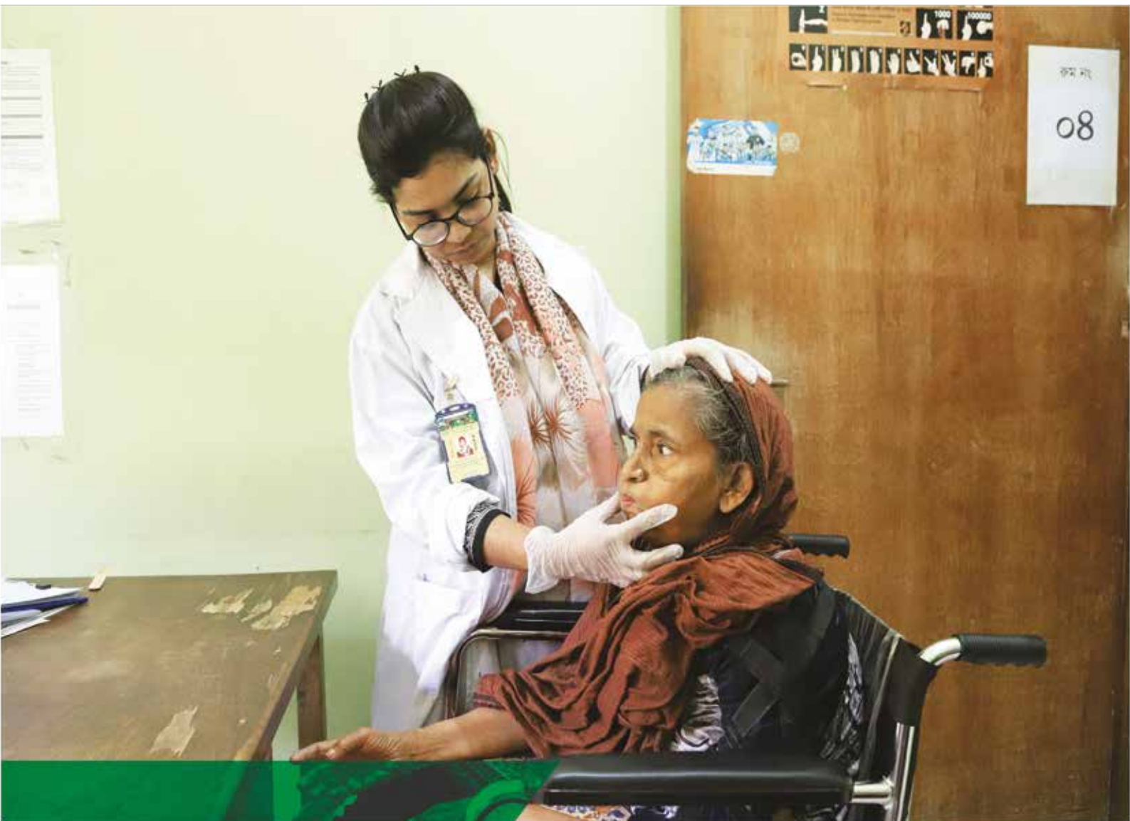
A patient affected by a stroke receiving Speech and Language Therapy

Speech and Language Therapists work to prevent, assess, diagnose, treat, providing counseling and other follow-up services for children and adults with speech, language, social communication, cognitive-communication, voice, fluency and swallowing disorders to achieve the department's aim of providing outstanding and caring services to people with disabilities from all over Bangladesh. The Department of Speech and Language Therapy is dedicated to providing a wide range of services for individuals, families, support groups and providing information for the general public.