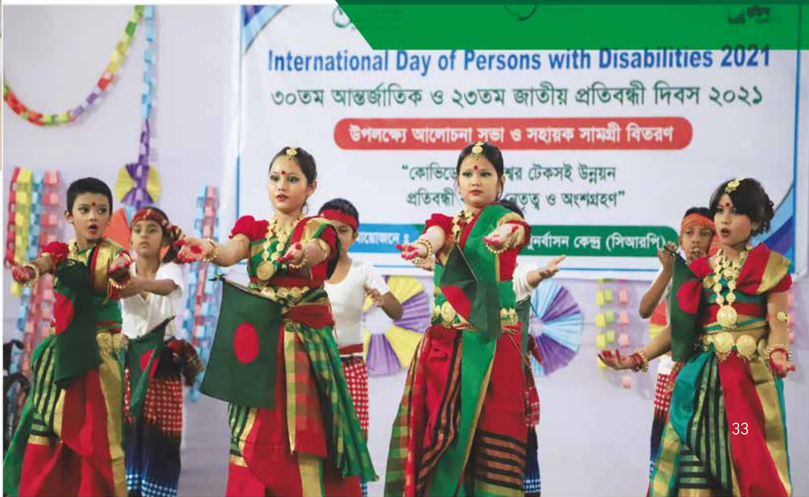
Children of WMTS performing in a programme

William & Marie Taylor School (WMTS) is the inclusive school of CRP established in 1993. There are two units named Inclusive Education Unit (IEU) and Special Education Needs Unit (SENU). The IEU follows the national curriculum of Bangladesh and SENU follows Individual Education Plan (IEP). During the reporting year, the school had 26 teachers and 276 students, including 116 children with a disability (CWD) who constitute 42% of the total students. Among these 116 CWD, 46 students studied in the IEU and 48 students who have more individualized education needs have studied in the SENU. Due to the Covid-19 pandemic, the school was closed for last two years and from 2022, the physical classes with other co-curricular activities have started following the health instruction conscientiously.