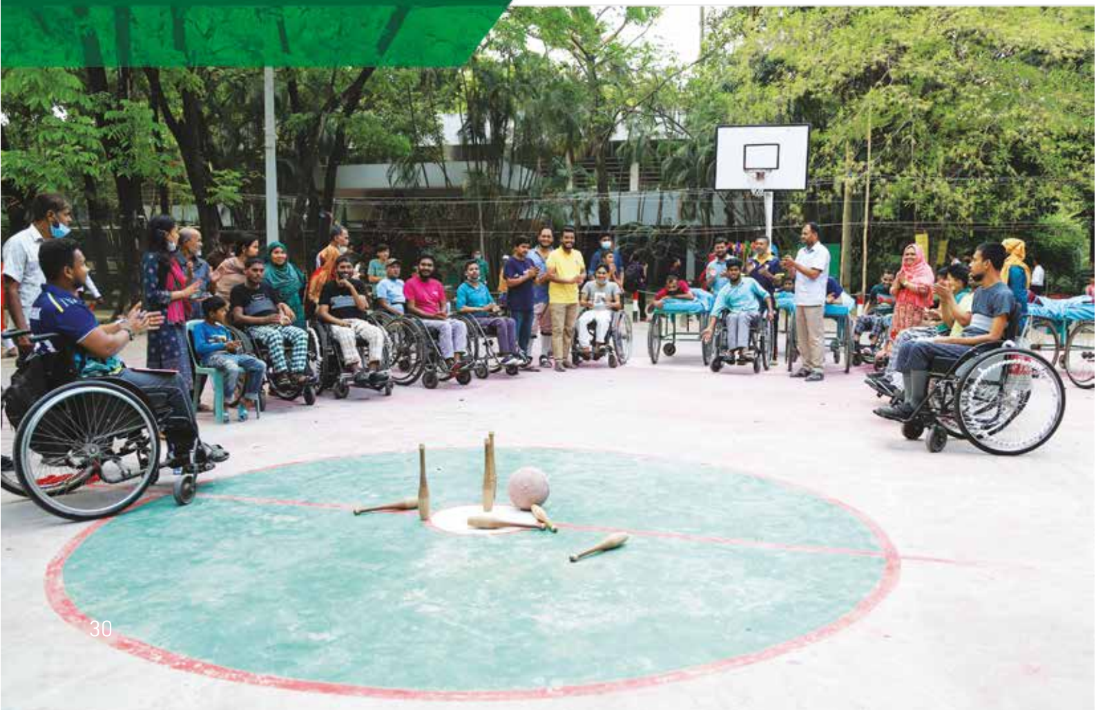
In-patients playing skittles as part of their sports rehabilitation