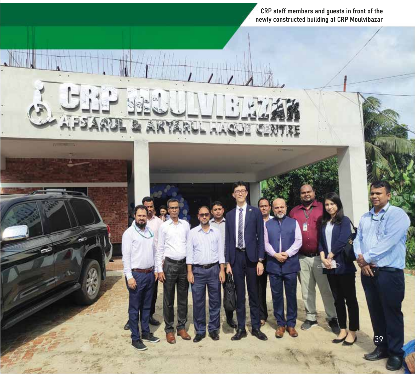
CRP staff members and guests in front of the newly constructed building at CRP Moulvibazar

Amount of subsidy provided to 241 poor patients: 2,05,130