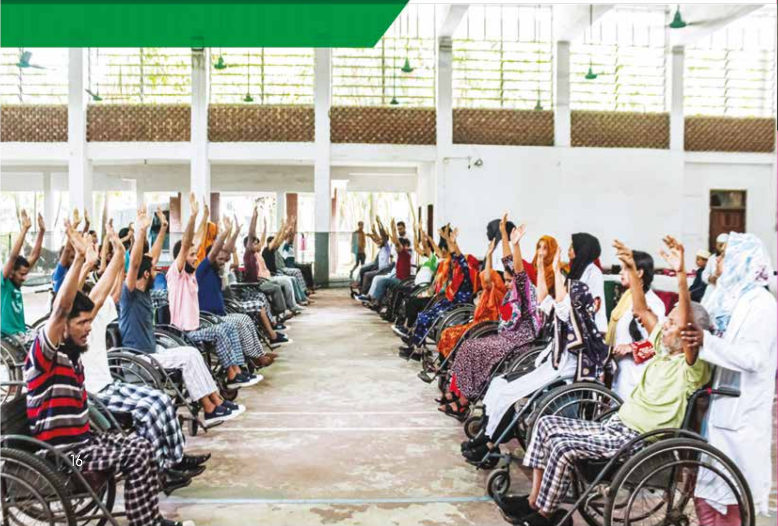
Group physiotherapy session for admitted patients

On September 8th, 2021, the physiotherapy department held celebrations for World Physiotherapy Day by publishing a special supplement in two national newspapers, containing special speeches from the honorable prime minister and from the relevant ministries. Also, we have hosted a live Facebook program, a webinar on our Facebook page titled "Department of Physiotherapy, CRP". The department also produced a video documentary on the activities of the Physiotherapy department sponsored by Nagad, the Digital Financial Service of Bangladesh Post Office.