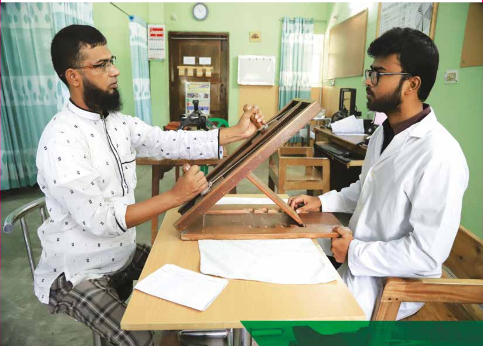
An occupational therapist working on a patient's arm mobility

Occupational Therapy (OT) department is one of the integral parts of CRP's service delivery providing services to various health conditions. In OT-SCI in-patient unit 215 (72%) patients completed all stages of rehabilitation process out of 298 admitted patients in the current reporting year and their functional outcomes based on SCIM (Spinal Cord Independence Measure) were completely independent 24 (11.16%), independent with modified environment 141 (65.58%), independent with moderate support 30 (13.95%) and independent with maximum support 20 (9.30%) of the SCI survivors. Moreover, OT out-patient unit served 3431 patients and Hand Therapy and Splinting unit provided 947 customized splints and modified assistive devices. Also 1508 group sessions were conducted.