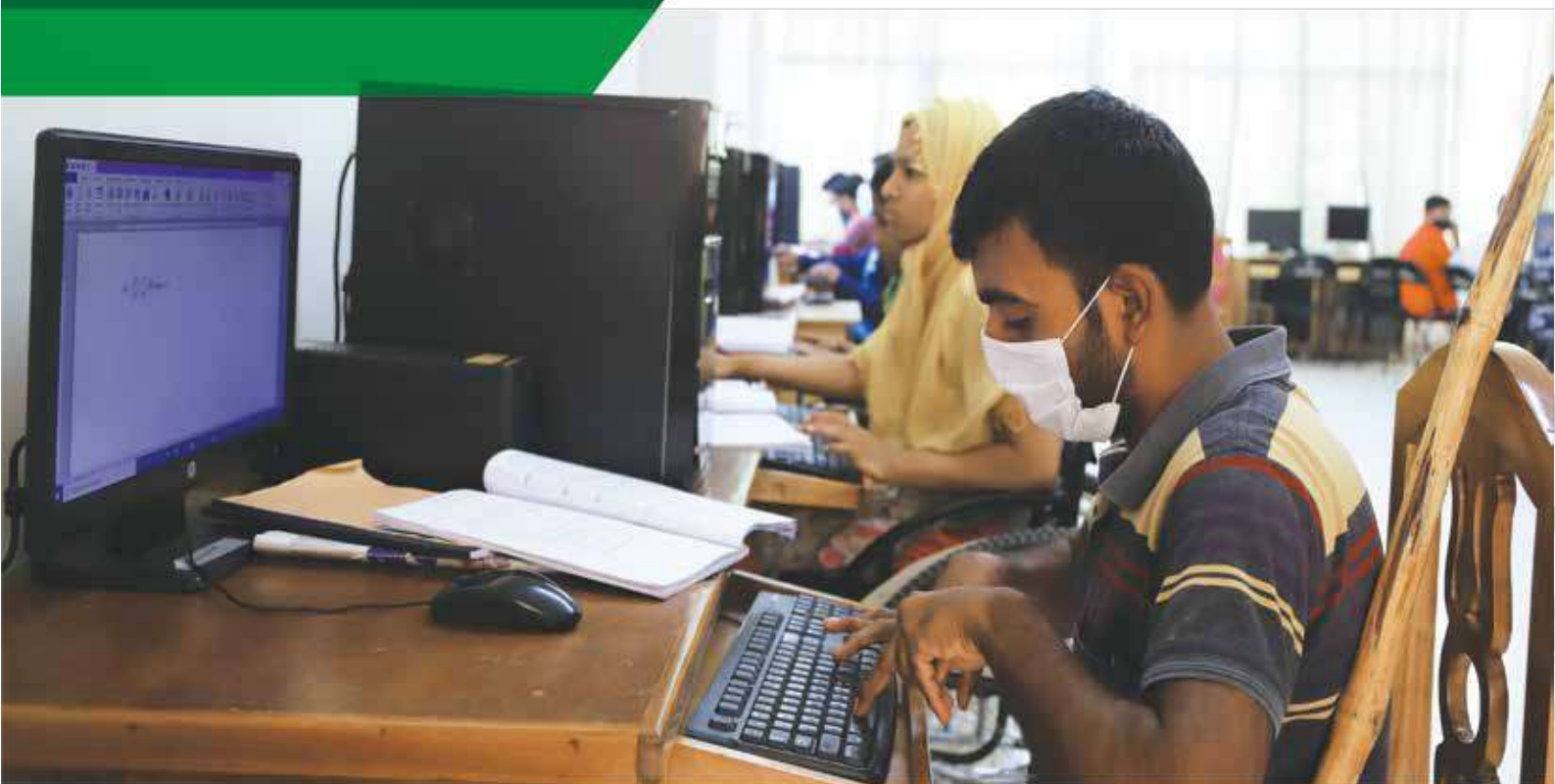
Trainees learning computer operation at the vocational training institute

CRP Madhab Memorial Vocational Training Institute (CRPMMVTI) has gained the trust and become a popular desired training hub among people with disabilities for capacity building and social inclusion by which they can achieve economic empowerment through self and wage employment. Here at CRPMMVTI, all offered vocational courses are free for people with physical disabilities. During the reporting year, CRPMMVTI has signed an MoU with Palli Karma-Sahayak Foundation (PKSF) to launch a project titled "Training Programs for the disadvantaged group (Persons with Disability)" where skills training matches the market demand and aims to develop persons with disabilities as skilled workers/manpower. A total of 237 people with disabilities received vocational training in this reporting period.