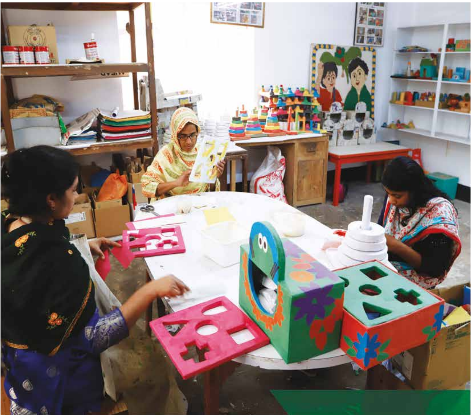
Staff at the APT department making products with recycled paper and cardboard

In this reporting year APT Unit has produced and delivered 340 cylindrical grasp boards, 85 manipulation ring sets, 62 shape boxes and 614 different toys with raw material support from different organizations like VIYELLATEX, ICRC and others.