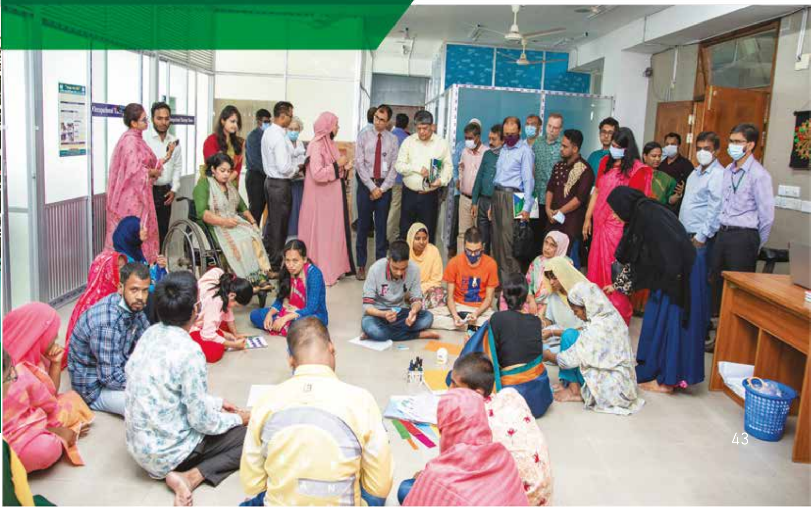
Guests visiting the mental health day centre's activities during the project inception program at CRP Mirpur