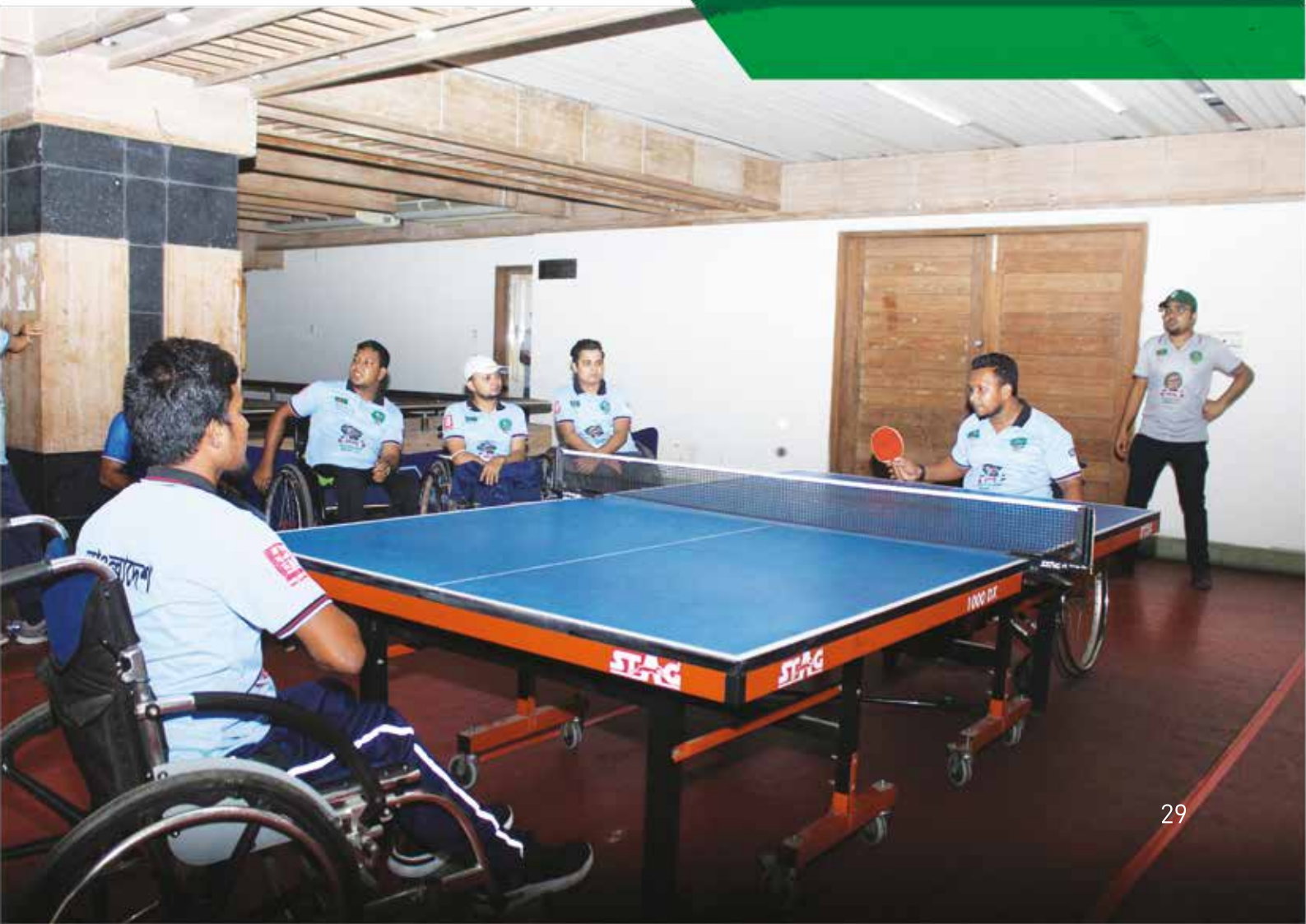
Participants in Bangabandhu Para Table Tennis Tournament 2022