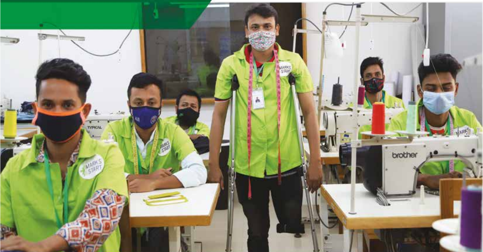
Trainees at M&S project's industrial sewing machine operation class

The aim of this project is to ensure economic empowerment by creating employment opportunities for the people with disabilities in the area of Readymade Garments (RMGs). CRP offers free vocational training courses for the people with disabilities along with 100% job placement in the Marks & Spencer supply factories or other factories in Bangladesh. The Marks & Start project is a Corporate Social Responsibility (CSR) initiative of Marks & Spencer and since 2006, they have been promoting disability inclusion activities. Till the reporting period, a total of 3,179 persons with disabilities received training on the operation of both industrial sewing machines and linking machines. A total of 85 Marks & Spencer supply factories offer inclusive job placement to the persons with disabilities via Marks & Start Industrial project of CRP.