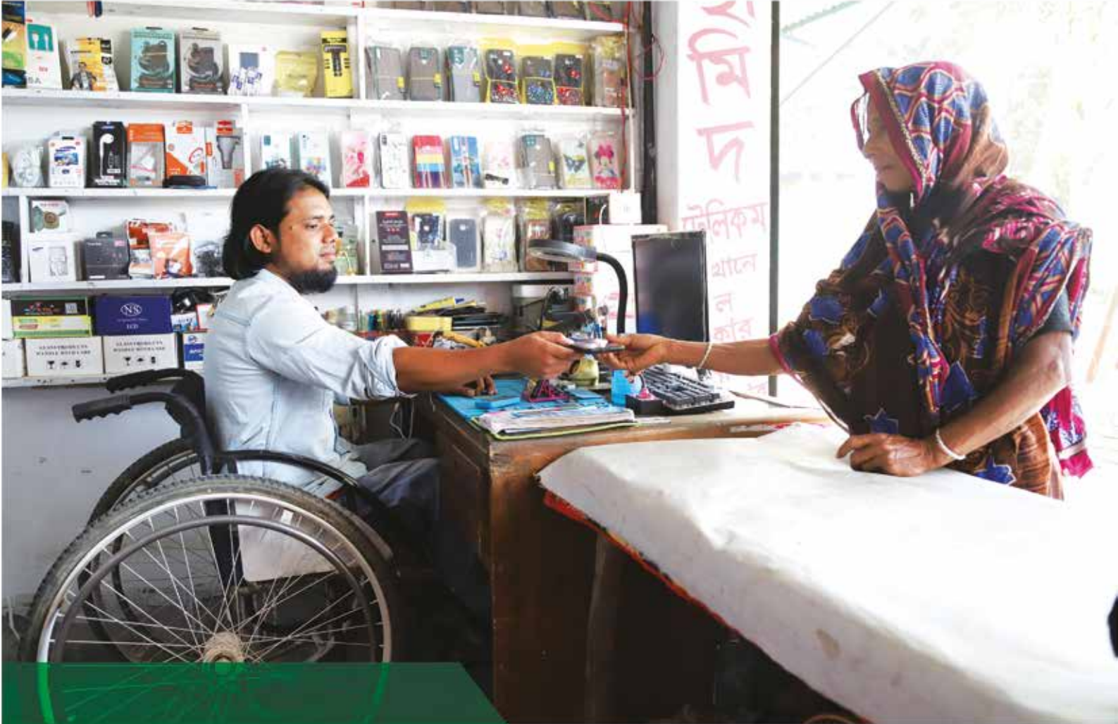
An ex-SCI patient running a shop after completing training at CRP