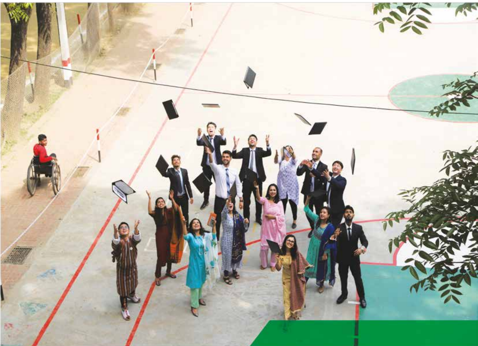
Graduates of MRS 5th batch during their farewell programme

The Board of SAARC Development Fund (SDF) approved phase-II of the project at its 31st board meeting in Colombo, Sri Lanka on 23-24th August, 2019 which expected to result in the enrollment of 135 students with scholarships and provision of enrollment of 15 self-financing students during the project period - July 2022 to June 2027.